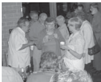
Gold panning demo

A second similar class will be held during one of our 2004 Wildacres Workshops with new representatives from the Federations joining the group. You can join them also and see what all the laughter is about. Dates will be announced shortly.