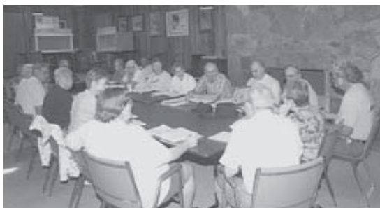
A full house at the Judging Class at Wildacres.