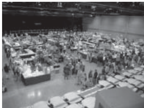
Two minutes after the "opening bell" sounded and the dealers were starting to get busy.

Held at the Mid-Hudson Civic Center in downtown Poughkeepsie, the show had 30 dealers featuring a va-