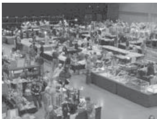
Ready to go on Saturday morning at the Mid-Hudson show.

* Also Eastern Representatives to American Federation Committees.