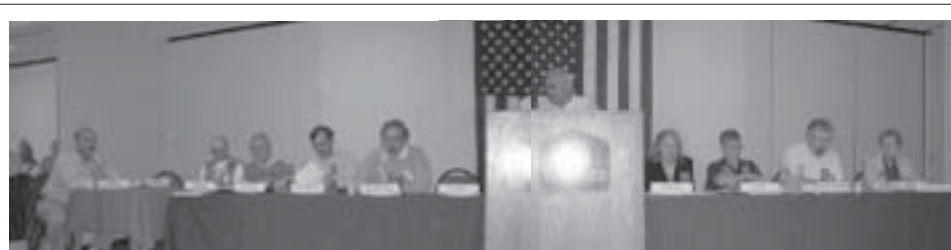
Members of the Executive Board at work.

Thank you Mid-Hudson Valley Gem & Mineral Society for a wonderful weekend. The EFMLS enjoyed visiting your show, watching the enthusiasm with which your club members tackled the myriad tasks of setting up and running the show, and visiting your area. You can be proud of what you accomplished and what you shared with the Federation!