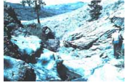
Figure 1. Blue Schist of Tunk Creek