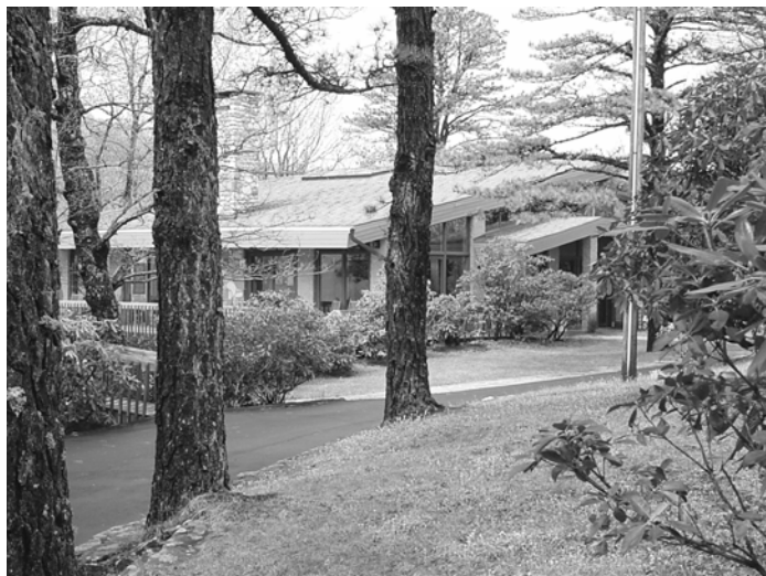
View of the lodge at Wildacres.

The meals were very good and plenty of it. I think I gained a few pounds. Everyone at Wildacres was friendly and we met people from all over the southeast. One lady heard about us and came to Wildacres from New Mexico. The Federation invites any rock club member in the U.S. to attend. A good idea!!!