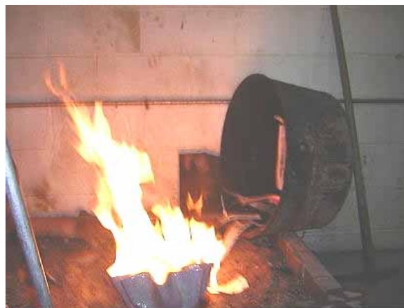
View of the metal pot used to extinguish the flaming raku piece .

This process went on over and over for two days until all the pieces were fired. We had to take dinner in shifts so someone could stay with the kiln. By the time we were