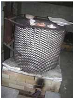
View of the Raku kiln used by Elizabeth.

We put the first few pieces in that morning, and then built 'nests' to put the pottery in after it came out of the kiln. These 'nests' consisted of sawdust and newspaper. After the piece has been in the raku kiln for about 20-30 minutes we raised the lid of the kiln to take out our pieces. Of course, these pieces have just been fired at about 1200° F so you cannot just reach in and pick them up. We had to put on big gloves that went up to our elbows and grab a pair of huge tongs that were more than a yard long. There were only two pairs of tongs, but an average of four pieces in the kiln at one time. So we