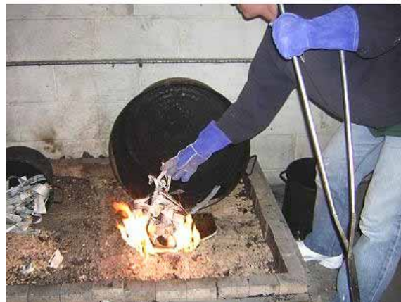
View of the fire generated when the Raku pottery piece was placed on a "nest" of newspaper and sawdust.

done around 7:30 P.M. we smelled like a campfire, or like we had been fighting a fire or something that was burning anyway! After the pieces cooled, we cleaned them up with water and scrub pads and a little Comet® to take off some of the black soot left on the piece. This was all you had to do, and voila! A beautiful piece of RAKU POTTERY! Now where to put it?