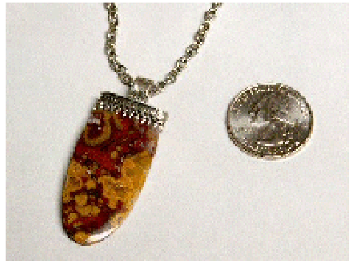
Above: (left) 4. Turquoise cabochon 28mm x 50 mm. Wire wrapped in 14K gold wire. Valued at $125. (Center) 6. Silver lace onyx cabochon 40x50mm 14k gold wire-wrapped. Valued at $75.00 (Right) 5. Tennessee Spider Web Agate polished free-form cabochon set in a sterling silver setting with a filigree bezel, on a sterling cable necklace chain. Value $250-$300. Below (left and center) 5. and 7. Two opal pendants set in 14K Gold settings. The cabochons measure 10x10 mm and 7 x20mm in size, and both show red and green fiery sparkles throughout. Each is valued at $200. (Right) 8. A rare and spectacular fiery blue-and-green 40x50 mm Louisiana opal cabochon. Value, $200-250.