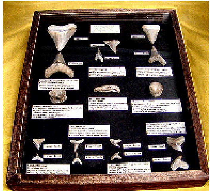
2. (Right) Case of Eocene Fossil Sharks teeth and vertebrae from Lee Creek, North Carolina Value $150 - $200.