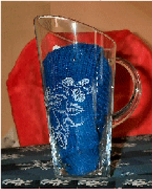
1. (Left) Engraved crystal glass pitcher. Value $125 - $150.

Please note: All values given for items are approximate show prices. Retail values would be corresponding greater